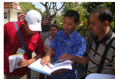
Evacuation Planning Training

www.gitews.org/tsunami-kit GITEWS/PROTECTS www.gitews.org