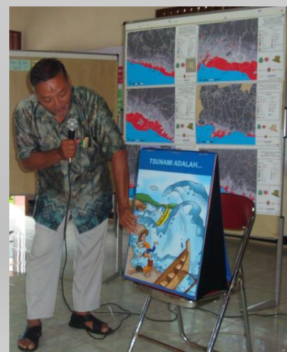
Community Outreach Training