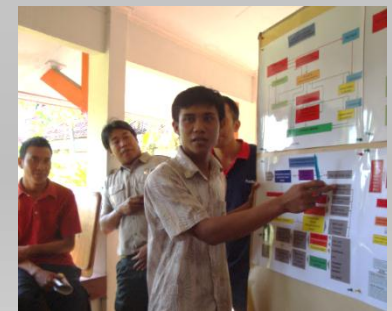
Training for Local Warning Services