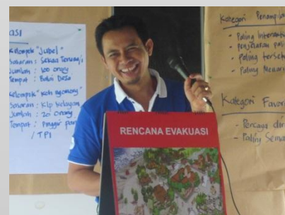
Tsunami-Preparedness Facilitator Training