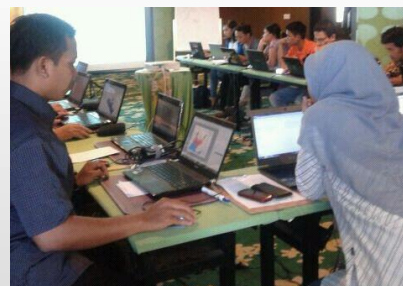
Quantum GIS Training