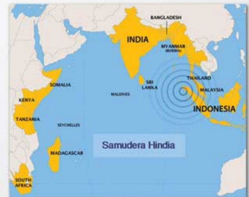
Countries Impacted by the Indian Ocean Tsunami of 2004

Following SEQIP's approach, the module was developed in a way that makes it possible for the teachers to integrate it into the pre-existing subject. This approach was made to cope with the fact the existing curricula is already too heavy and it was impossible to add disaster preparedness as a new subject. A team of consultants developed the module using simple terms, and a children-centred methodology. A member of the GTZ IS GITEWS team participated in the tsunami module development and implementation process. The tsunami module includes basic information about tsunami hazard and the Tsunami Early Warning System. It also