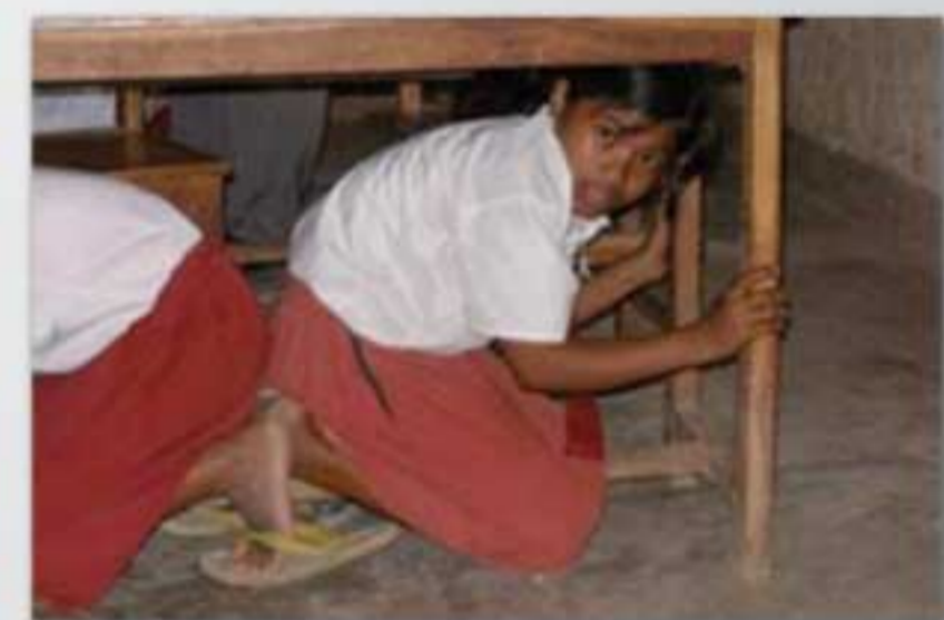
Earthquake Simulation in Elementary School