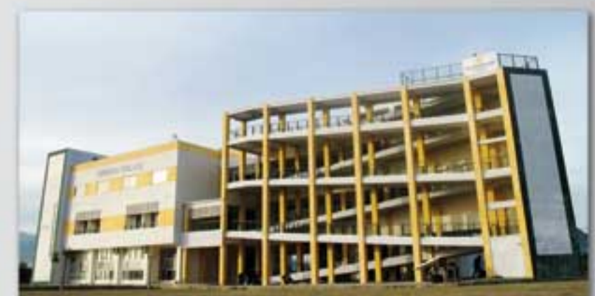
Escape Building in Banda Aceh