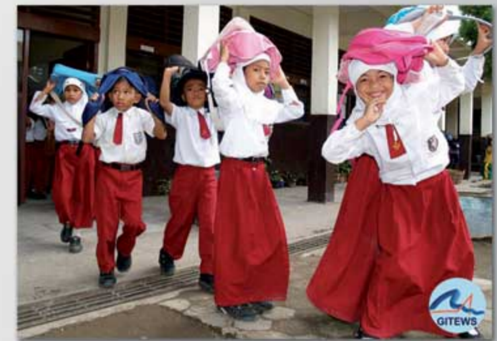
Tsunami Simulation in Elementary School on Padang