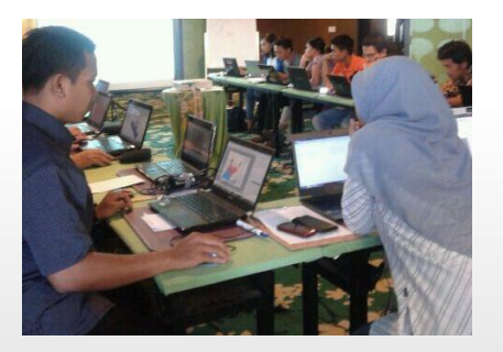
The basic Quantum GIS

Quantum GIS is free open source GIS software and is promoted together with Open Street Map and the plugin InaSAFE by BNPB / AIFDR.