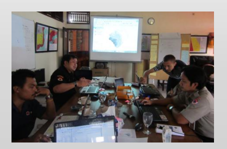
The follow up training