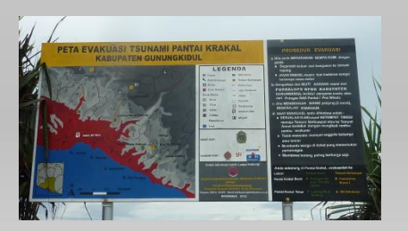
Billboard with evacuation map produced using Quantum GIS