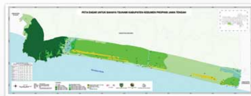
Base Map - Kebumen