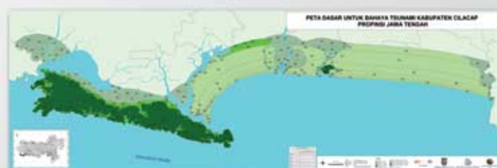
Base Map - Cilacap