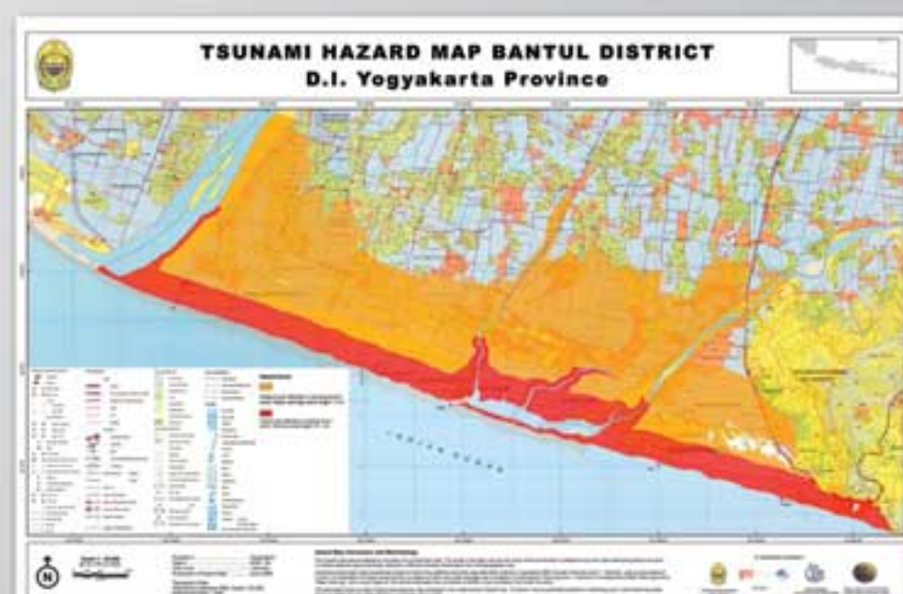
Tsunami Hazard Map - Bantul