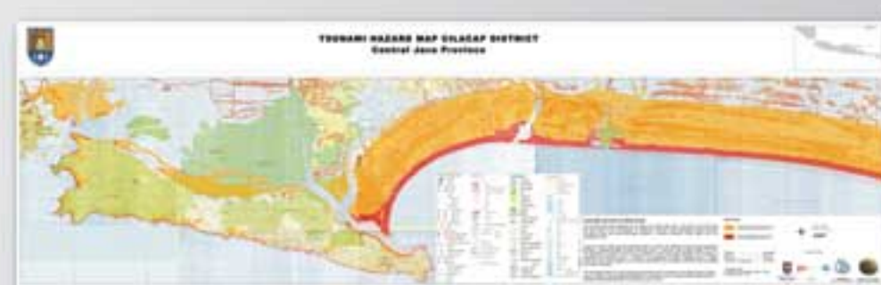
Tsunami Hazard Map - Cilacap