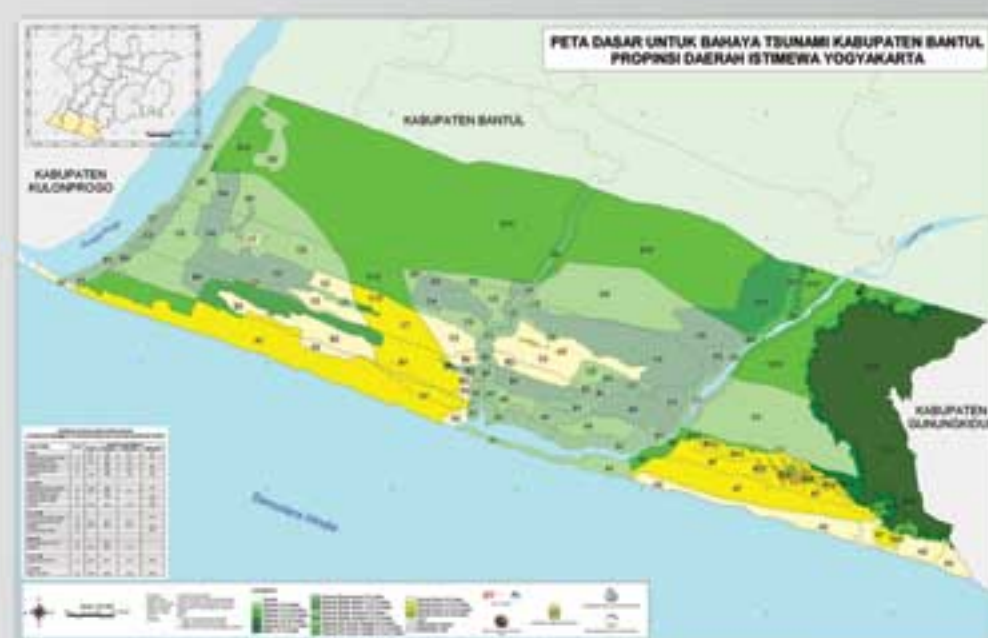
Base Map - Bantul