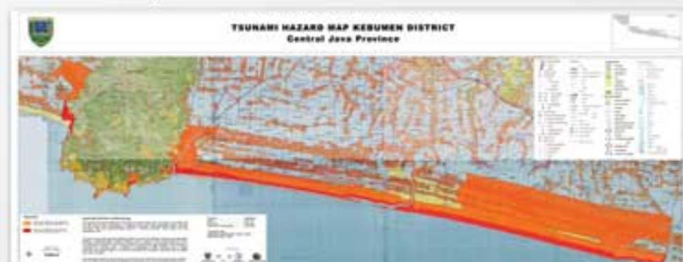
Tsunami Hazard Map - Kebumen